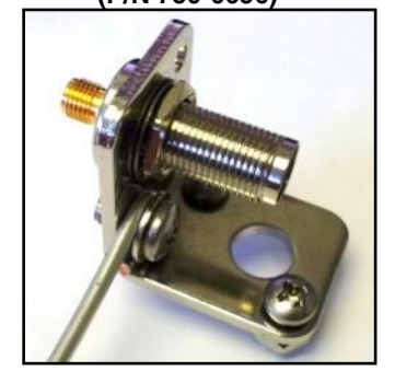
Shown with Optional Bracket (P/N 750-0656)