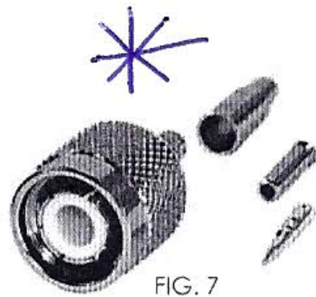
FIG. 7 RFT-1202-3, -3B1