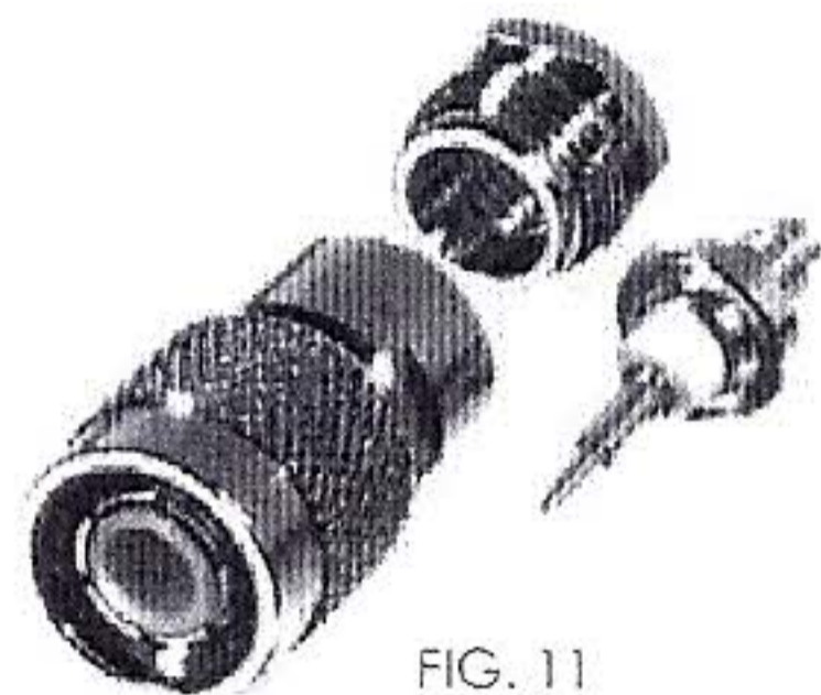
FIG. 11 RFT-1204