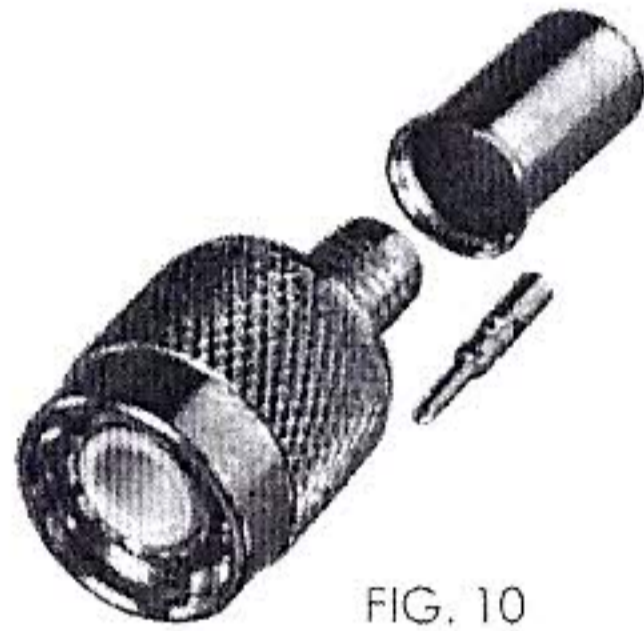
FIG. 10 RFT-1203-1P, -1X