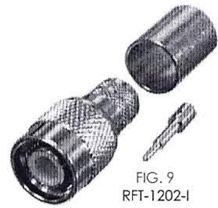
FIG. 9 RFT-1202-I