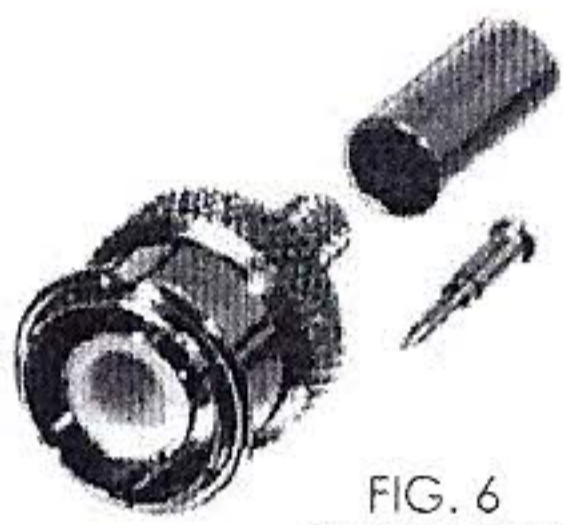
FIG. 6 RFT-1202-5