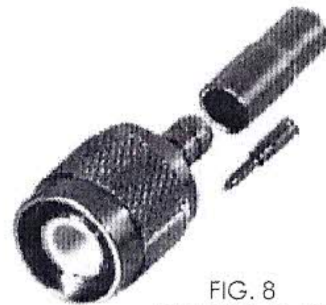
FIG. 8 RFT-1202-7, -7T