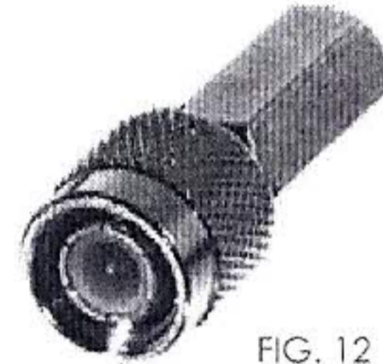
FIG. 12 RFT-1206